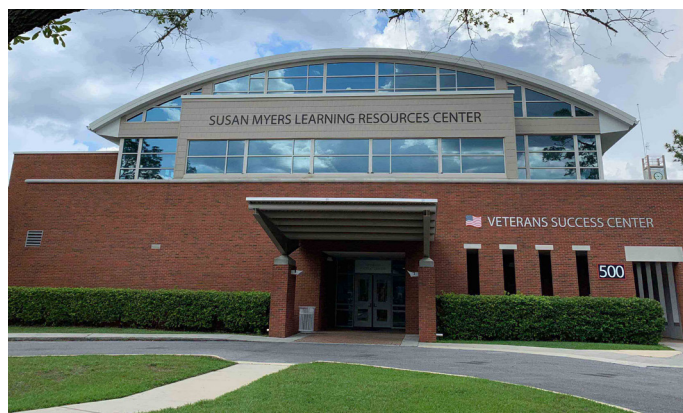
Photo: New signage was unveiled in June for the Susan Myers Learning Resources Center on the Niceville campus.