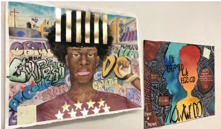
Artwork from the Dr. Martin Luther King Jr. Oratorical and Poster Contest held at NWFSC on January 18.