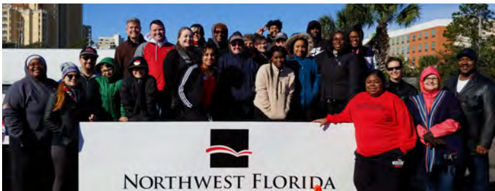
Members of the College's Diversity & Inclusion Task Force, Raider Life and college staff represented Northwest Florida State College in the Dr. Martin Luther King Jr. Day parade in Fort Walton Beach on January 20.