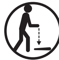
DROP ANY OBJECT