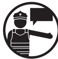
FOLLOW LAW ENFORCEMENT INSTRUCTIONS