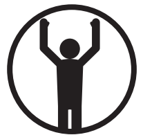
KEEP HANDS VISIBLE

For questions or additional assistance contact: Your local law enforcement authorities or the Northwest Florida State College Police Department (850) 729-6888 In event of an Emergency Dial 911