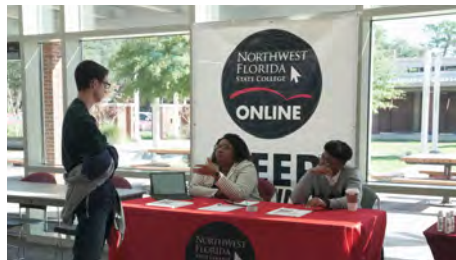
A student finds out information about NWF Online during Preview Day.