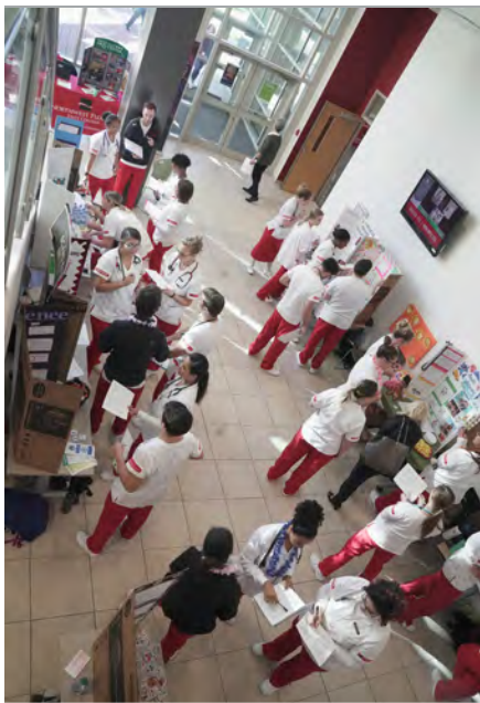
Nursing students share their research during Preview Day's Major's Fair.